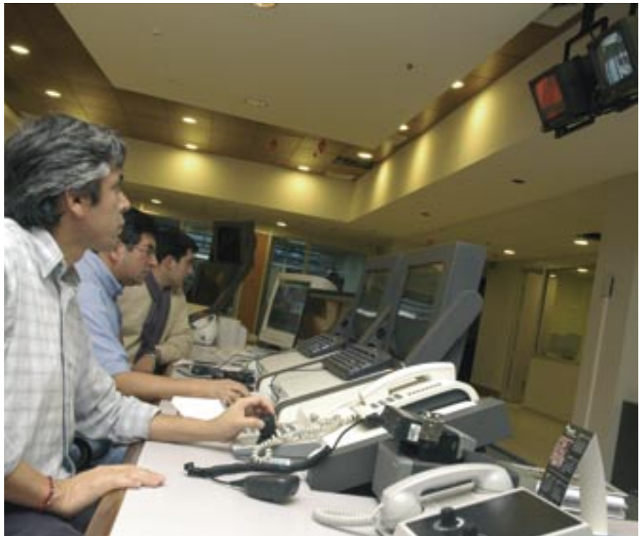
Control Room at the Santa Fe Mill

CMPC Celulosa is at the industry's forefront in terms of technology as a result of its new investments, particularly in Santa Fe Plant's Line 2, which is being built according to the most stringent global environmental standards. In parallel, a major and significant strategy in the field of human resources management is being developed.